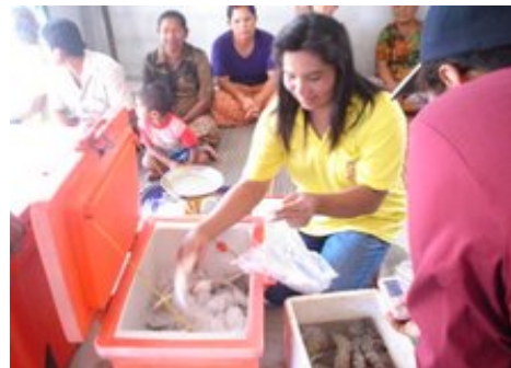
Illustration 4: Activities of women groups around Songkhla Lake

The above case reflects that moral is the key to successful development. When all parties have set their mutual goals and go for them, it can lead to the ultimate goal in the development of the country.